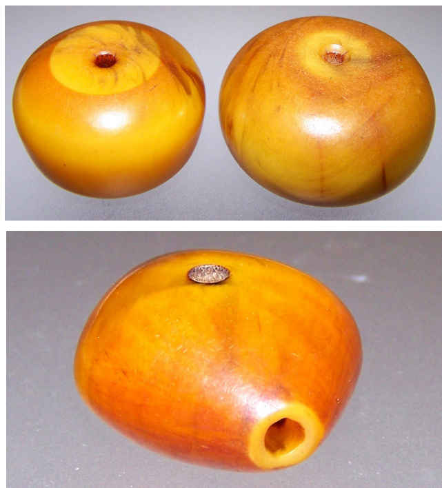
Figure 10. PF beads showing age-related surface browning with the original color visible at wear spots around the perforations.

The year 1910 has been established as the start of industrial production of phenol-formaldehyde resins and therefore, the earliest possible date for beads made of this material. By the early to mid-1920s, many PF products