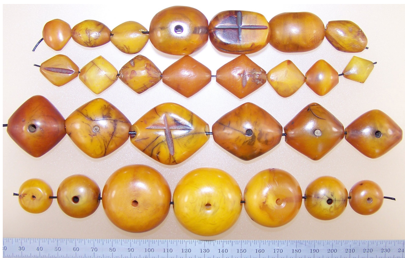
Figure 5. Modified oblate beads and smaller pieces of PF beads from Africa. Remnants of the original and cross-drilled holes are visible on some beads.