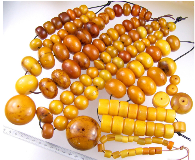
Figure 1. Beads of phenol-formaldehyde thermosetting resins (PFs) from the African trade. The large bead at bottom center is 52.9 mm in diameter (metric scale).

The introduction of PF beads into the U.S. market is documented by Allen (1976:22) who notes that the trend began around 1971, with the “importation of large, attractive, amber-like, oblate-shaped beads from Africa.”