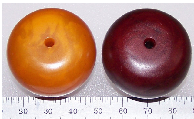
Figure 8. PF bead subjected to elevated temperatures in air (right) compared to an unheated one (left). Thermal cycle was 1 hour at 121 C, followed by 1 hour at 149 C, followed by 1 hour at 177 C.

Red and red-brown PF beads are found among the amber-colored beads in the African trade (Figure 9). The color could be due to the use of the type of PF that changes color under ambient conditions, but in all probability it is