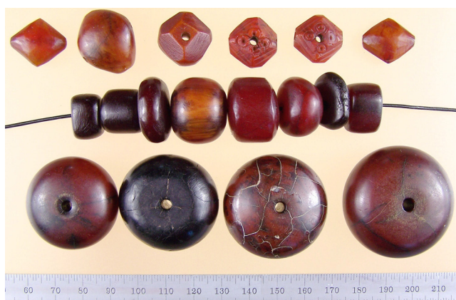
Figure 9. Heat-treated PF beads from Africa. Note that some beads have been reshaped as well as heat treated.

the result of a heat treatment applied by the African owners. One color-altering technique reportedly employed in Africa is heating in palm oil (John Picard 2015: pers. comm.), presumably to help avoid thermal gradients and the resulting stresses that can break the bead (a bead heated by the author to about 232 C in air broke in half).