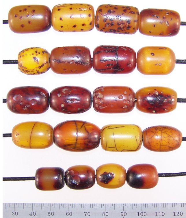
Figure 7. PF beads from Ethiopia showing a variety of surface modifications.

Since a large number of formulations of PFs were developed in the same time frame as Faturan (the earliest reference found by Holdsworth and Faraj is 1917), and many patents sought to overcome the problem of relatively rapid color changes in PFs, it is possible that Faturan is not the only product that manifested this behavior. Additional research on early commercial PF formulations is needed for clarification.