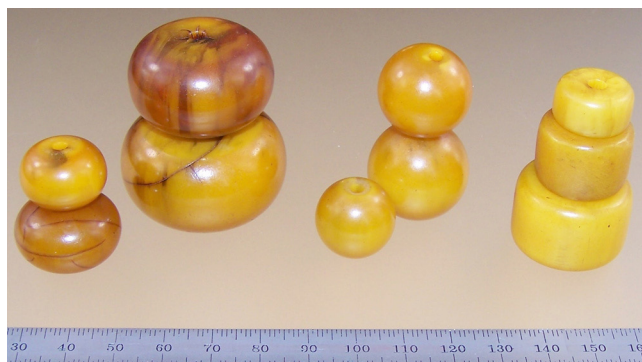
Figure 2. Typical as-manufactured phenolic bead shapes found in the African trade.

The arrival of PF beads in the U.S. coincided with the flood of glass beads from Africa that began in the late 1960s and peaked in the early 1970s (Picard and Picard 1987:4). These beads primarily relate to the heyday of the Venetian and Czech bead industry: the mid-1800s to the mid-1900s. It therefore seems logical to assume, as many did, that the “African amber” beads were roughly the same age.