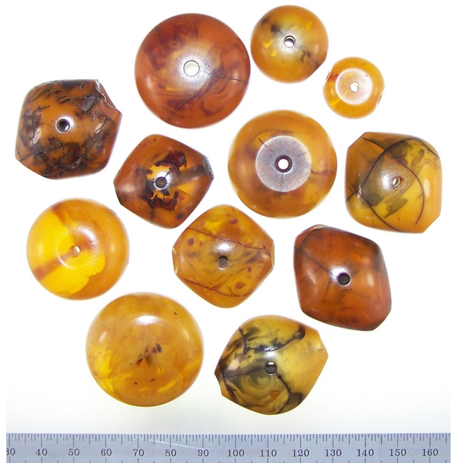
Figure 4. Color variation and marbling in PF beads from Africa.

The term "copal amber" also appears in the section on Natural Beads in a booklet by Gordon and Kahan (1976). Their sketch of a "copal amber" bead looks very much like a short, oblate PF bead, complete with a typical pattern of long, sparse cracks, such as seen on the largest bead in Figure 2. It is the author's opinion that their "copal amber" beads are actually made of PF, based on the range of colors noted (golden yellow to deep red or warm brown), the opacity (opaque or partially transparent), and the surface cracks (Figure 4). Regardless, it seems that a new term, "copal amber," arose around the time that PF beads from