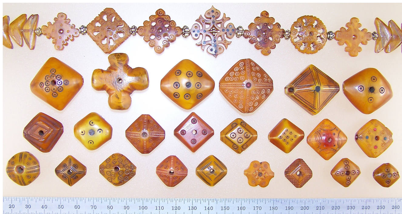
Figure 6. Carved, drilled, and decorated PF beads from Mauritania, Mali, and Morocco. The center bead, top row, and the two right-most beads, third row, show added red and blue pigment.